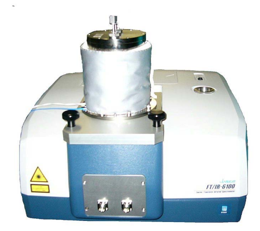
Figure 1. Full vacuum type FT-IR gas analysis system (10 meter cell)